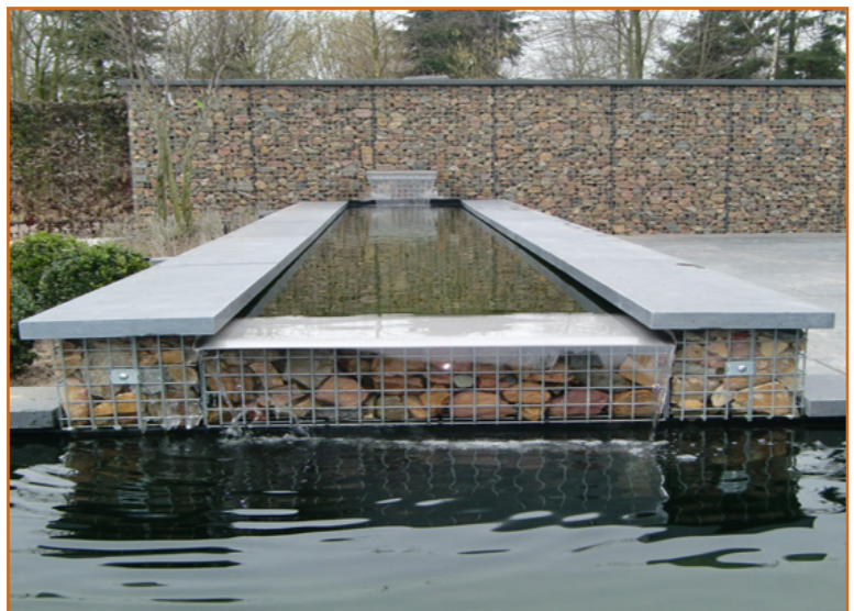
Heesch (NL) - private project