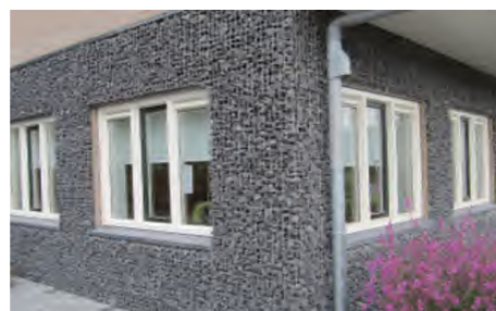
...your own home