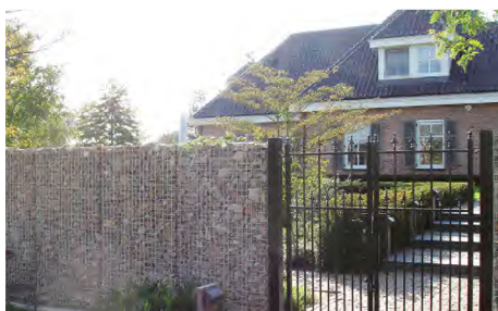
For a large garden...