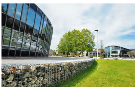
...your office garden...