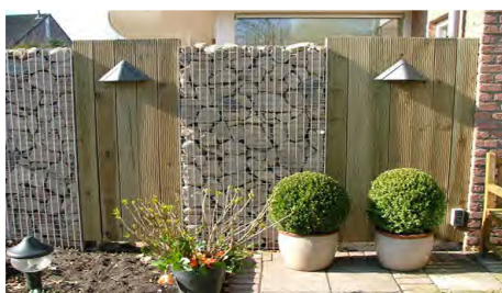
...or smaller one...