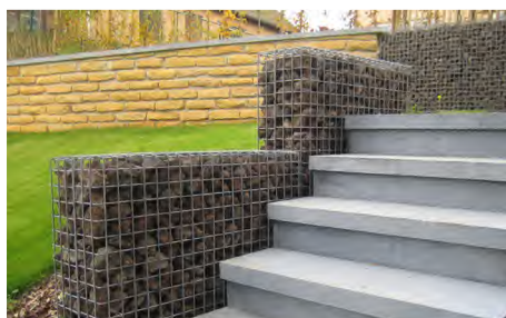
...your garden steps...