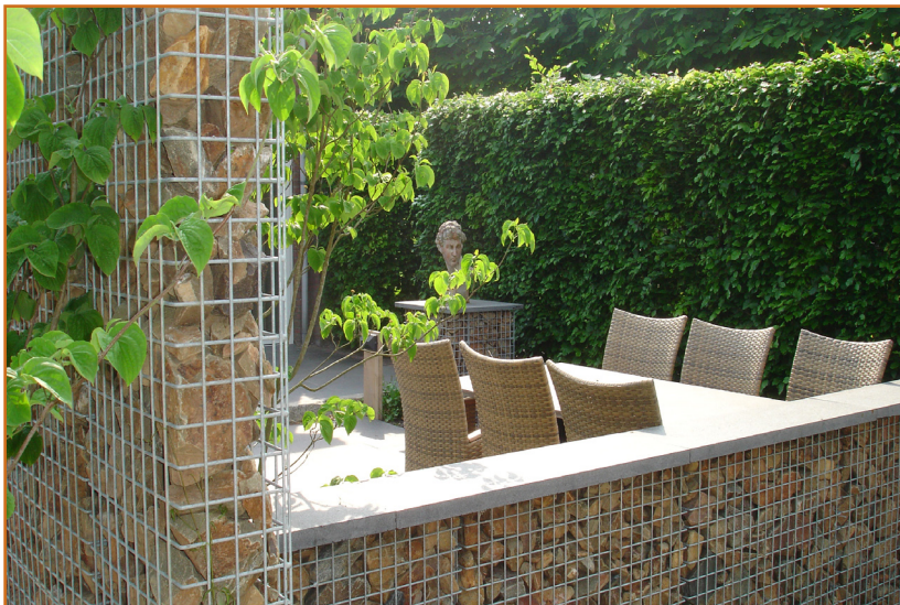
Geffen (NL) - private project