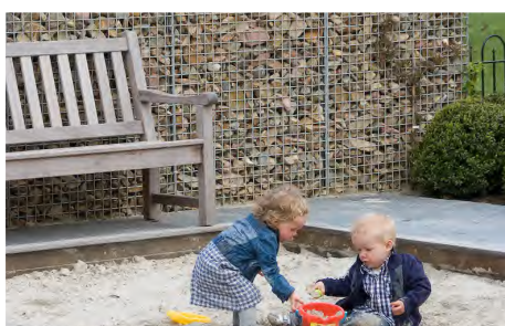
...or safe garden